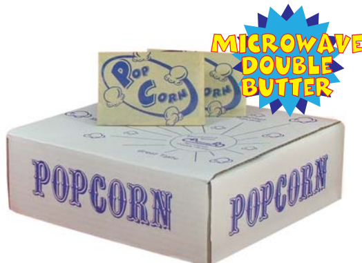
MICROWAVE DOUBLE BUTTER