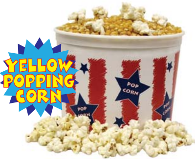
YELLOW POPPING CORN