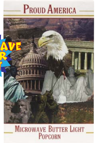
MICROWAVE BUTTER LIGHT