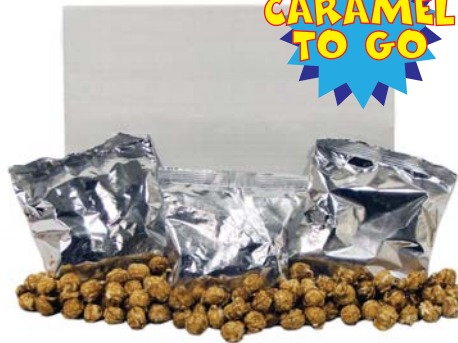
CARAMEL TO GO