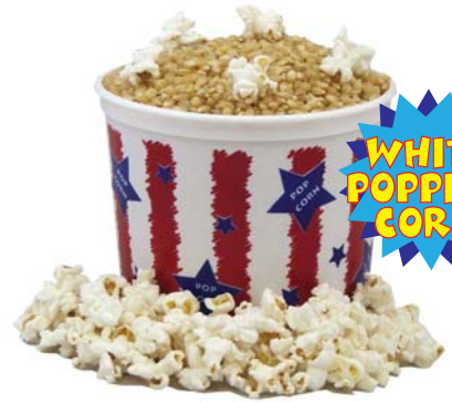
WHITE POPPING CORN