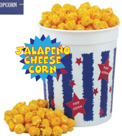
JALAPENO CHEESE CORN

THANKS FOR SUPPORTING YOUR LOCAL SCOUTS!