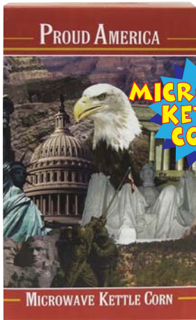
MICROWAVE KETTLE CORN